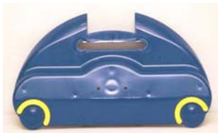
SIDE PLATE ASSY W/HOLE