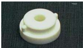
BUSHING FOR LOWER CASING