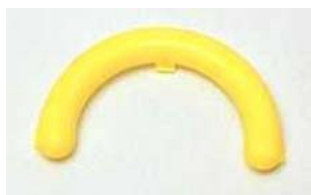
SIDE PLATE GUARD