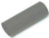
SHRINK TUBE 1625 60mm