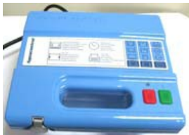
POWER SUPPLY SUPER BR EU