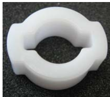
CASE FOR PIN