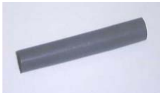
SHRINK TUBE EP00110 CUT