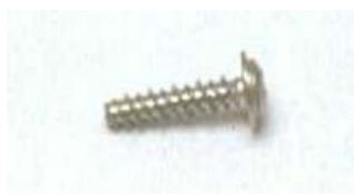
SCREW #8X11\16 PHIL 2700