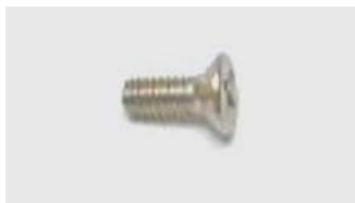
SCREW M4X12 S\S