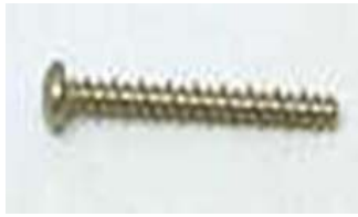
SCREW #8X1.175 PH PN 2500