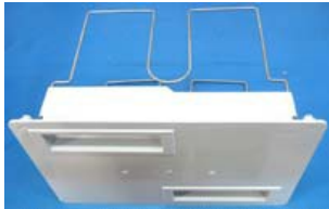
BOTTOM LID ASSY