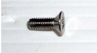
SCREW M3X10 PHIL DIN-965